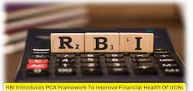
RBI Introduces PCA Framework To Improve Financial Health Of UCBs

The Reserve Bank of India (RBI) will transition 500 financially weak Urban Co-operative Banks (UCBs) from the Supervisory Action Framework (SAF) to the Prompt Corrective Action (PCA) framework starting April, 2025. This shift aims to enhance regulatory oversight, ensure early intervention, and restore financial stability.